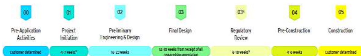
Figure 1: Customer Project Lifecycle (for complex projects) 1

Energization Delays – California’s clean energy and climate policies, including the expansion of renewable electricity, the electrification of buildings, and the transition to zero-emission