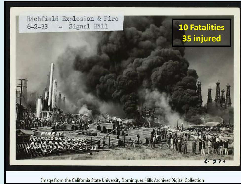
Richfield Explosion & Fire 6-2-33 - Signal Hill