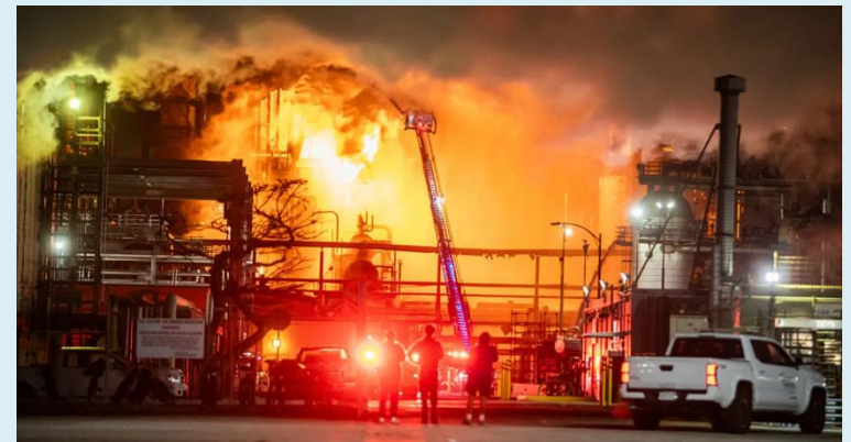
Oct 2025 Chevron El Segundo