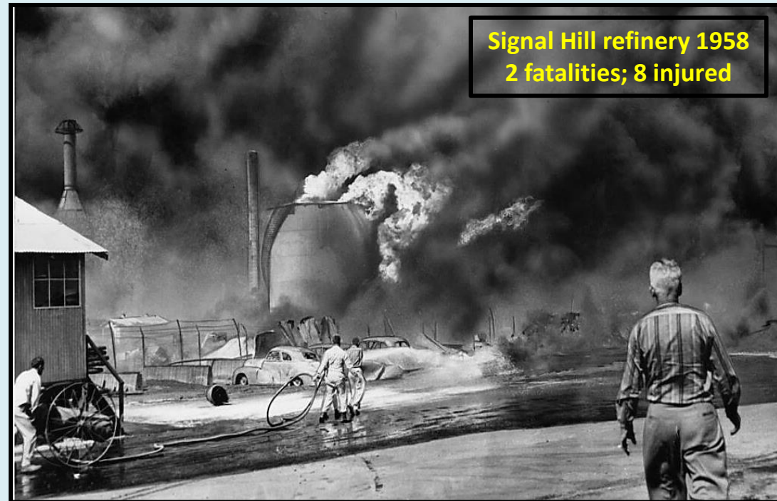
Signal Hill refinery 1958 2 fatalities; 8 injured