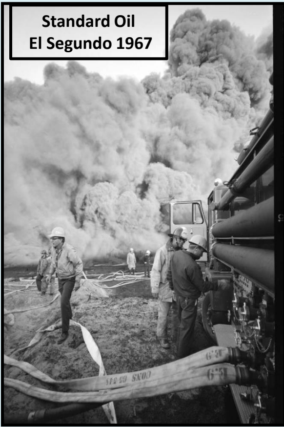
Standard Oil El Segundo 1967