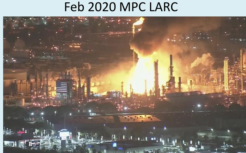
Feb 2020 MPC LARC