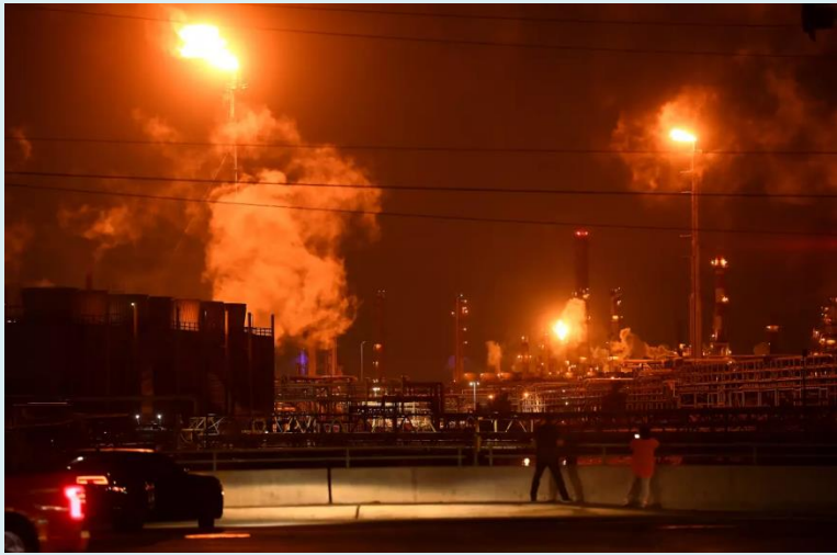
Sept 2021 MPC LARC