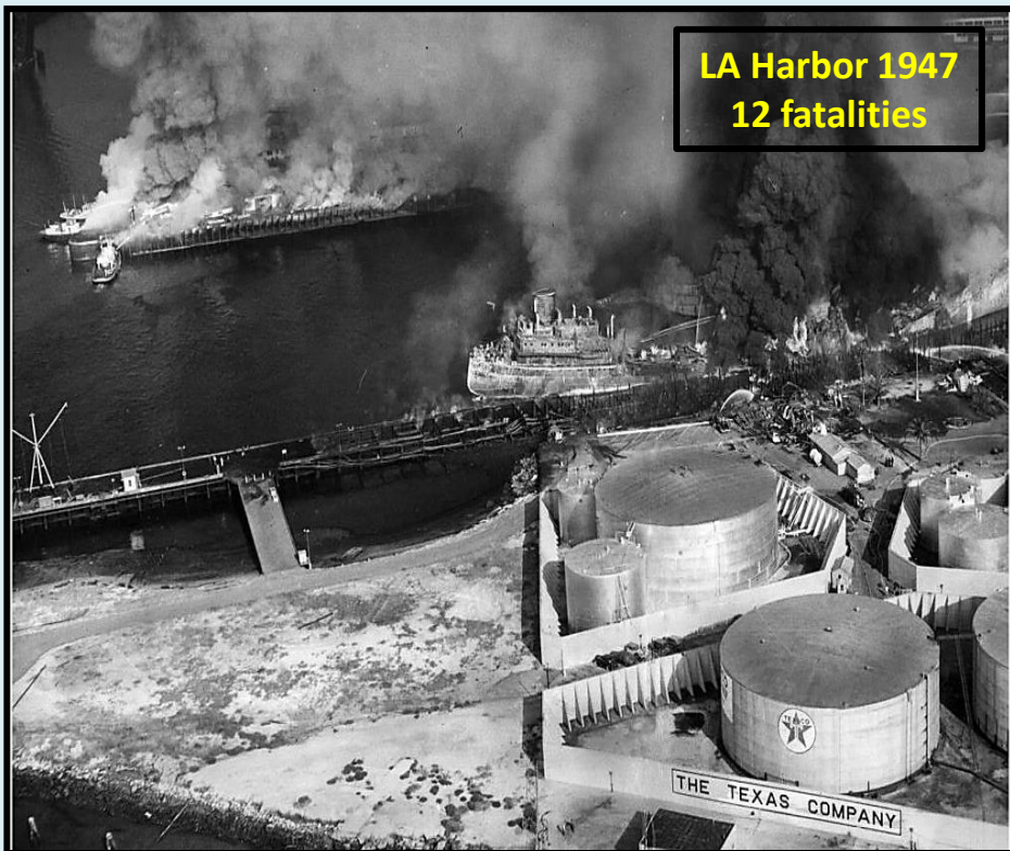
LA Harbor 1947 12 fatalities