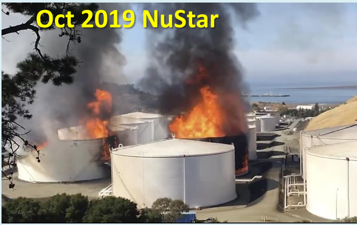
Oct 2019 NuStar