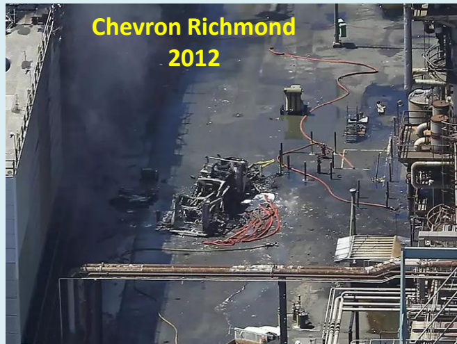
Chevron Richmond 2012